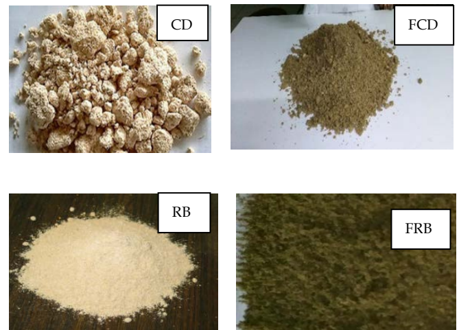
Fig. 2. Cassava dregs (CD) vs fermented cassava dregs (FCD) and rice bran (RB) vs fermented rice bran (FRB), (Photo: private document)

fermentation and the rice bran fermented with Aspergillus niger (RBF) is presented in Figure 2. At the initial study, the ingredient was apparently whiter, while the fermented was blackish brown (because the color of Aspergillus niger spores is black with additional brownish molasses).